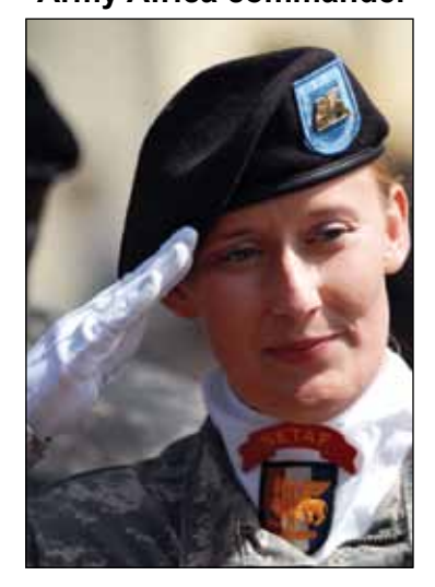
Community events pages 6 & 7

The U.S. military community in Vicenza welcomes new U.S. Army Africa commander