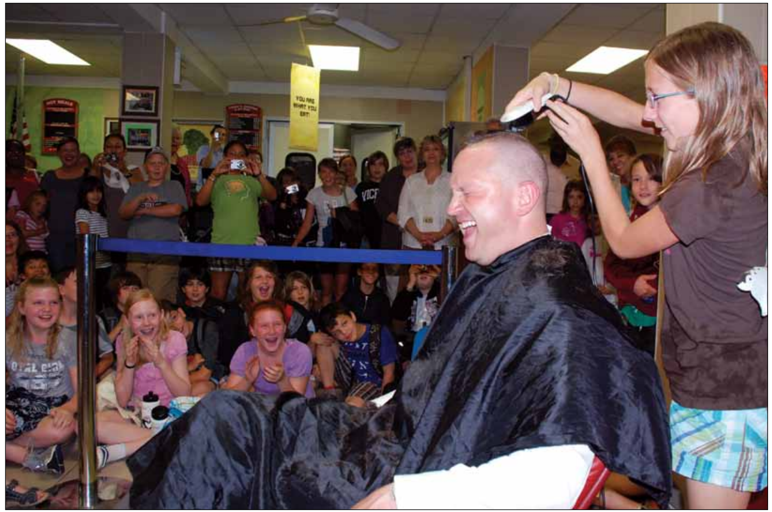
Shear, shorn, gone!: